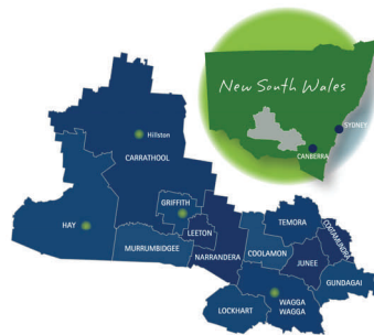
The RDA encompasses 13 Local Government Areas as shown in the map above