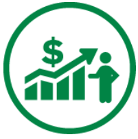
Jobs and Economic Development

Our approach coordinates activity across five key areas: