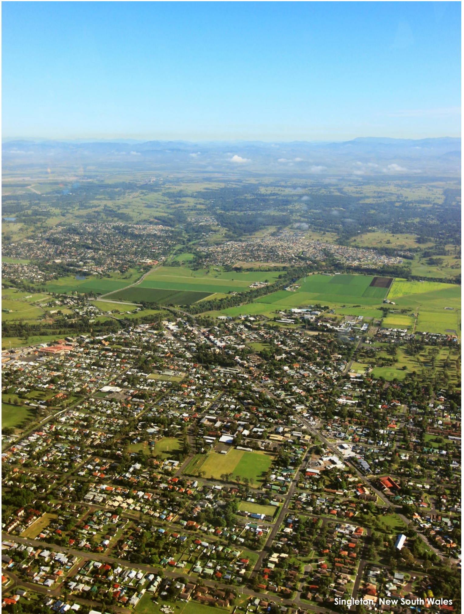
Singleton, New South Wales