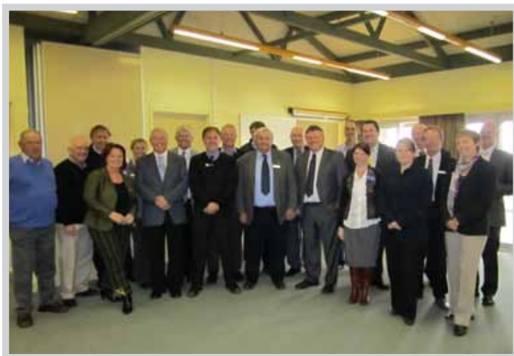
Regional planning consultation attended by General Managers & Mayors from 13 LGAs at Murrumbidgee Rural Studies Centre, Yanco.

These forums provided opportunities for local and state government, non government agencies, business and community organisations to recognise the strengths, act on emerging opportunities and build capacity to face the challenges of living in regional and rural centres.