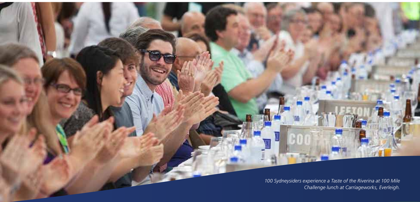
100 Sydneysiders experience a Taste of the Riverina at 100 Mile Challenge lunch at Carriageworks, Everleigh.

For further information: www.100milefoodchallenge.com.au