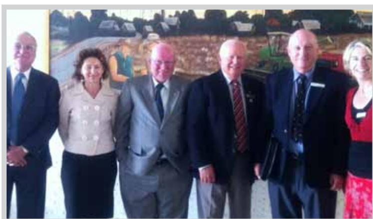
RDA Riverina & RDA Murray presented on overview of current activities to RAMROC at Jerilderie Shire Chambers. RAMROC represents the interests of eighteen Member Councils in Murray and Western Riverina region of NSW.