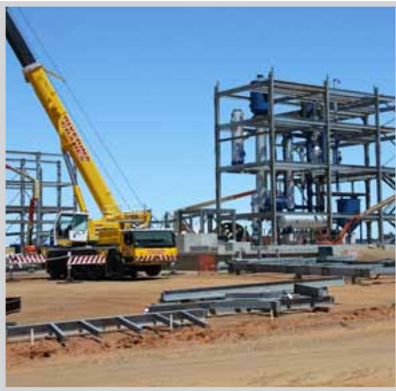
Business Development at Bomen Industrial Park.

Visit www.rdariverina.org.au for more information.