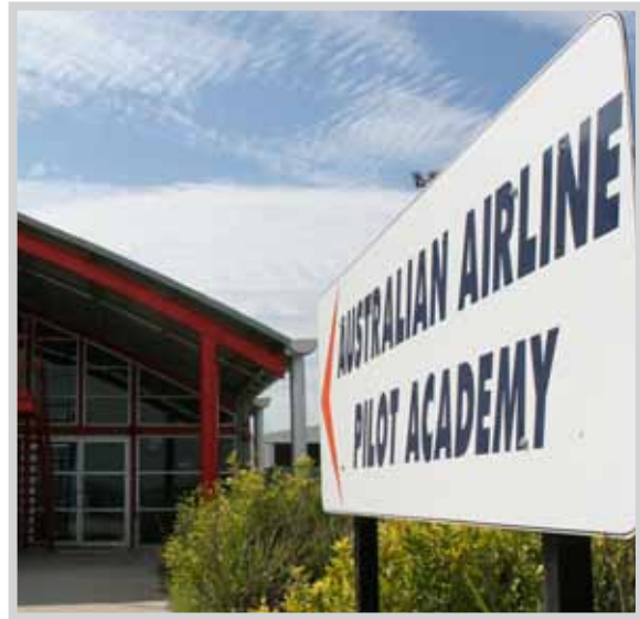
Australian Airline Pilot Academy, Forest Hill.