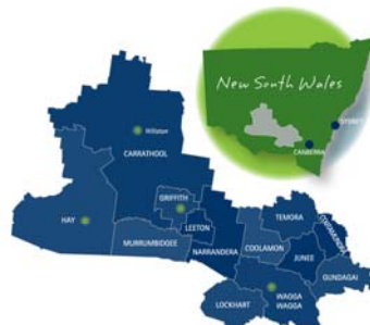
The RDA encompasses 13 Local Government Areas as shown in the map above

RDA-Riverina Website: www.rdariverina.org.au